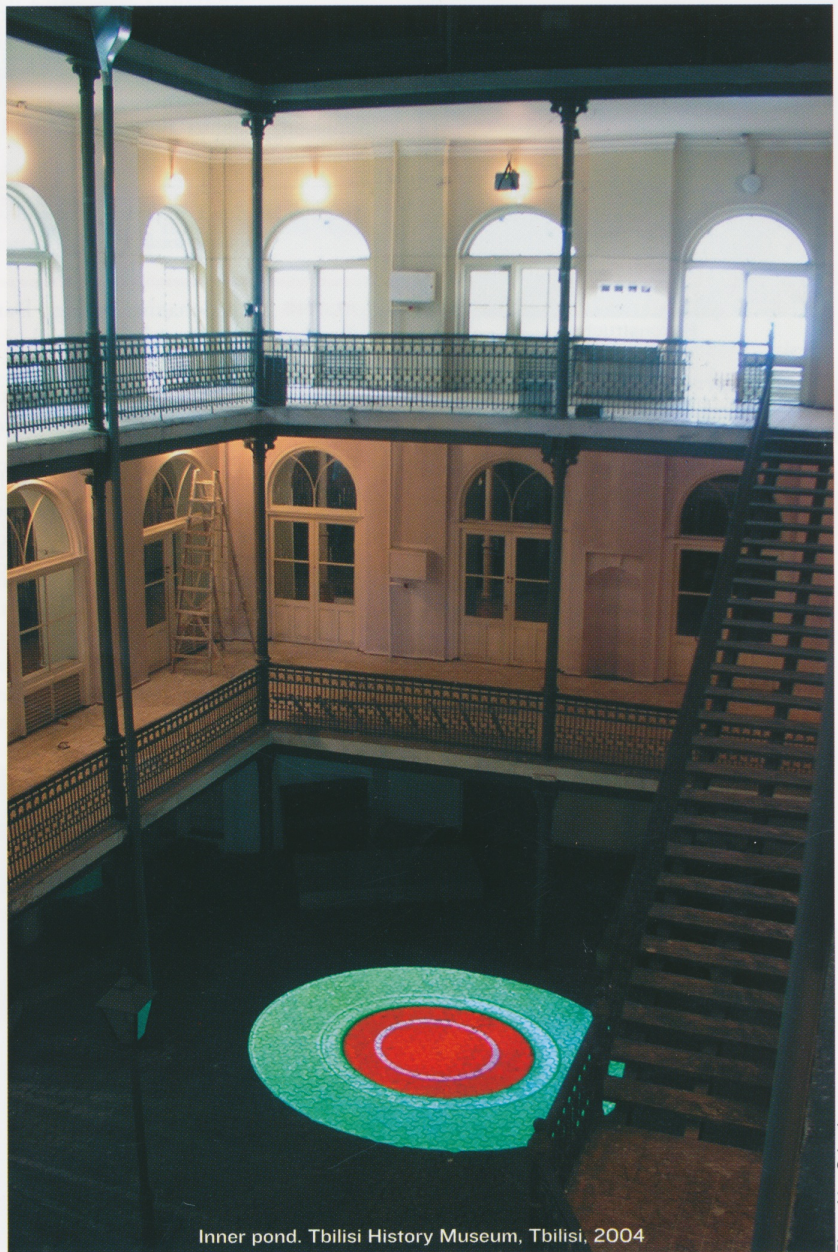
Inner pond. Tbilisi History Museum, Tbilisi, 2004

At the end of the 1990s, Lina Selander began to make use of old family snapshots. Sewing Continued on page 2 >