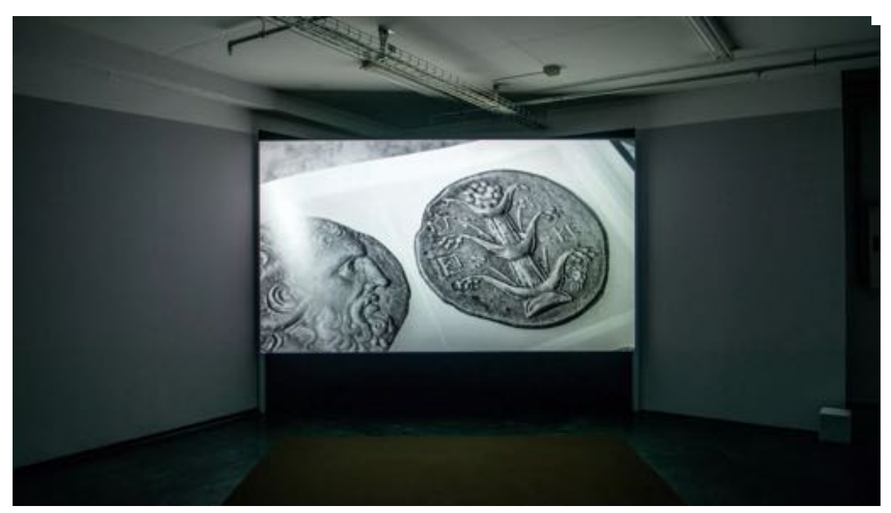
Lina Selander, Silphium, 2014, installation view.