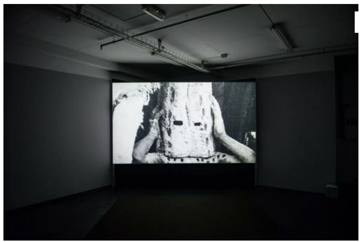
Lina Selander, Silphium, 2014, installation view.

South likes: Lina Selander at Kunsthall Trondheim, Trondheim Silphium Vunethall Trondheim, Trondheim, Namuss